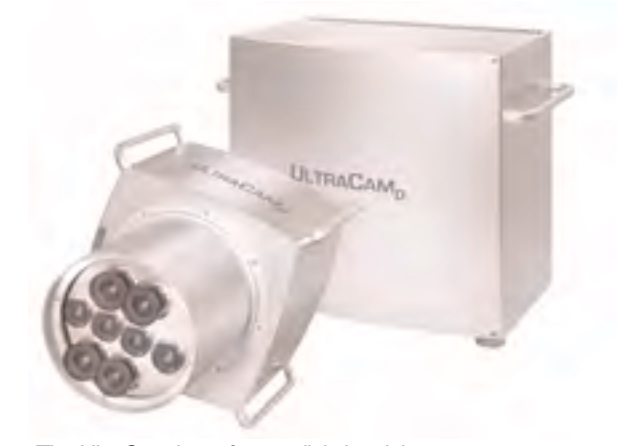
The UltraCam large format digital aerial camera system